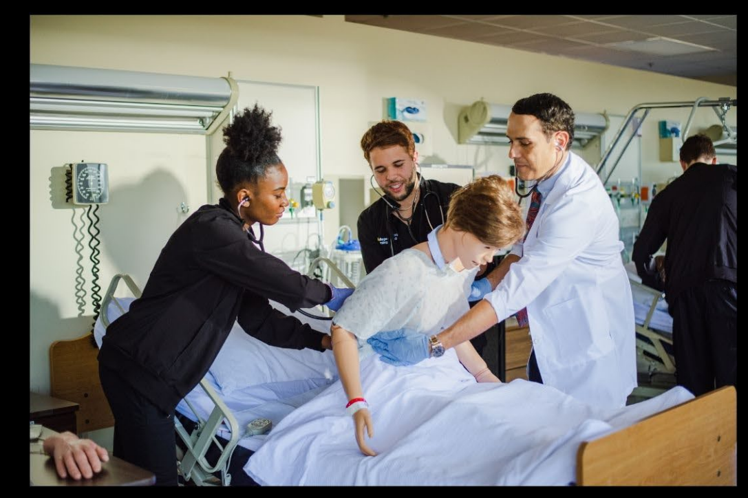
EXCELLENCE IN SIMULATION AND TECHNOLOGY