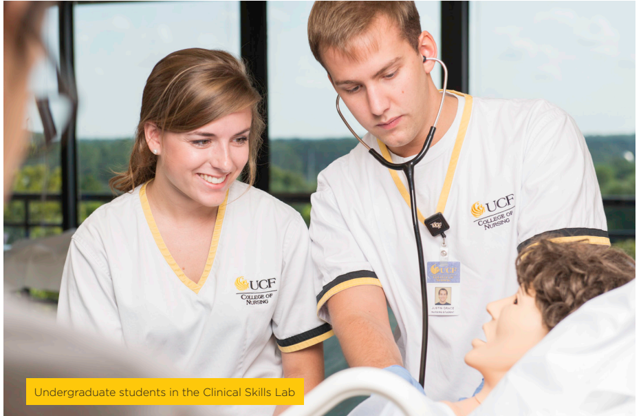
Undergraduate students in the Clinical Skills Lab