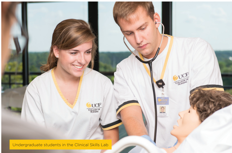
Undergraduate students in the Clinical Skills Lab